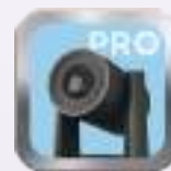
PTZ Control Pro 2