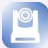
Camera Management Platform